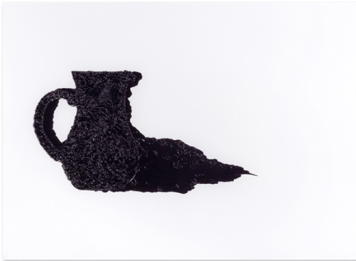
PITCHER #3 (SPILLED INTERIOR) 2017 Stenciled ink monoprint 22 x 30" (55.9 x 76.2 cm) A series of 34 unique works, #15 AS17-248