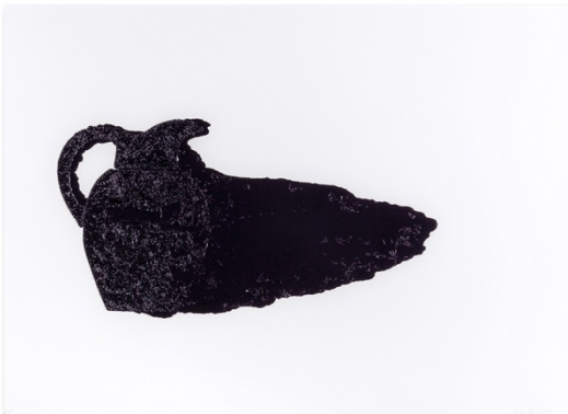
PITCHER #1 (SPILLED INTERIOR) 2017 Stenciled ink monoprint 22 x 30" (55.9 x 76.2 cm) A series of 34 unique works, #15 AS17-246