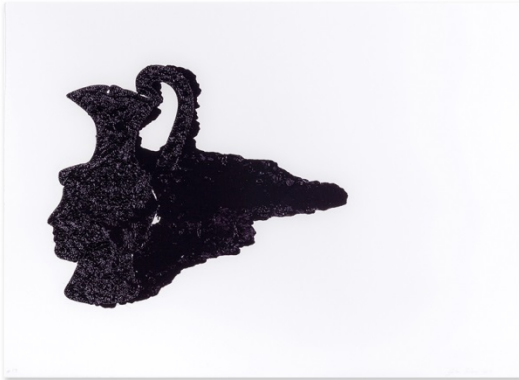
HEAD VASE (SPILLED INTERIOR) 2017 Stenciled ink monoprint 22 x 30" (55.9 x 76.2 cm) A series of 34 unique works, #17 AS17-245