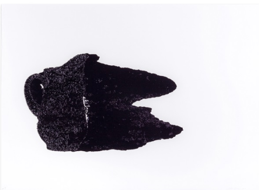
PITCHER #2 (SPILLED INTERIOR) 2017 Stenciled ink monoprint 22 x 30" (55.9 x 76.2 cm) A series of 34 unique works, #9 AS17-247