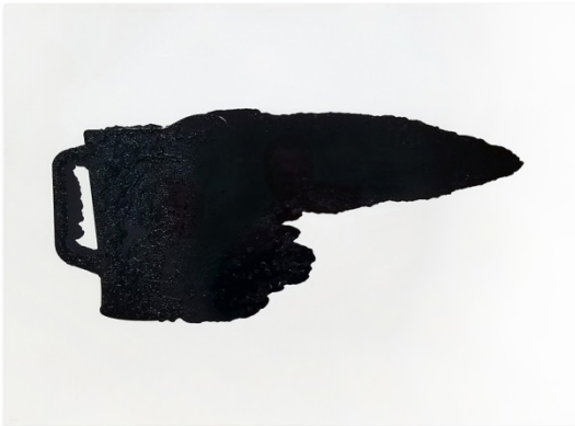
PITCHER #4 (SPILLED INTERIOR) 2017 Stenciled ink monoprint 22 x 30" (55.9 x 76.2 cm) A series of 34 unique works, #24 AS17-249