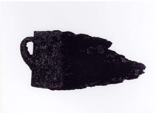
PITCHER #5 (SPILLED INTERIOR) 2017 Stenciled ink monoprint 22 x 30" (55.9 x 76.2 cm) A series of 34 unique works, #18 AS17-250