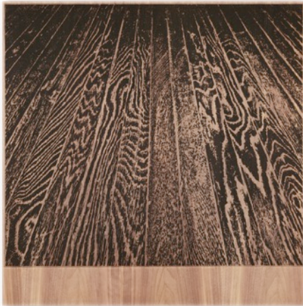
WOODEN FLOOR ON WOOD (ONE-POINT PERSPECTIVE) 2017