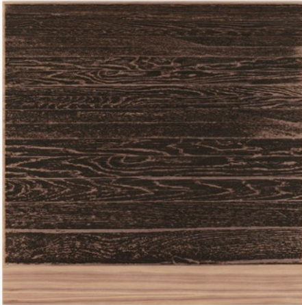
WOODEN FLOOR ON WOOD (HORIZONTAL) 2017