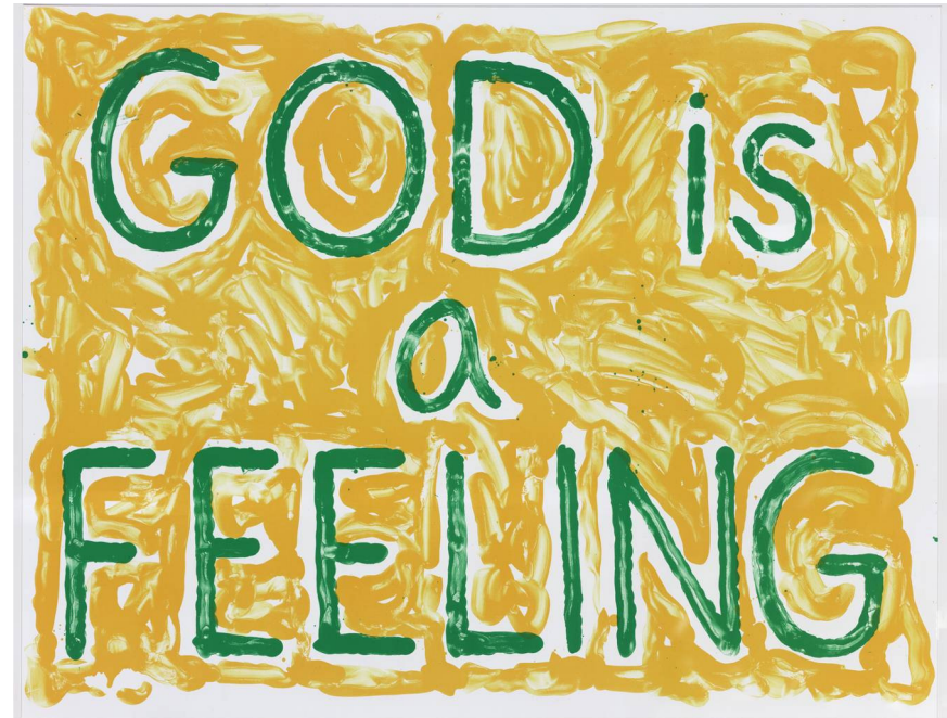
Johnathan Borofsky God is a Feeling , 2010 2-color lithograph 38 x 49" (96.5 x 124.5 cm) Edition of 25 JB08-1583