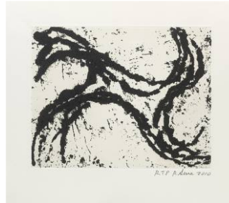
Junction #1 (RS10-3485)

Richard Serra Junction #1-13 2010 1-color etching 16 x 18" (40.6 x 45.7 cm) Edition of 50 RS10-3485-3497