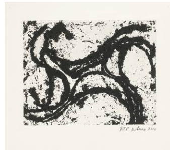
Junction #10 (RS10-3494)