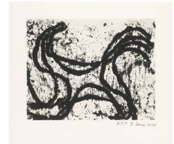
Junction #13 (RS10-3497)