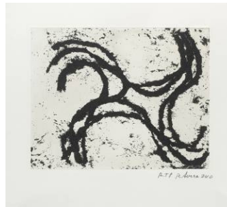
Junction #6 (RS10-3490)