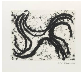
Junction #11 (RS10-3495)