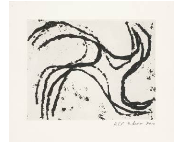
Junction #3 (RS10-3487)