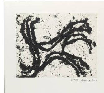
Junction #12 (RS10-3496)