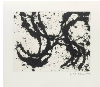
Junction #9 (RS10-3493)