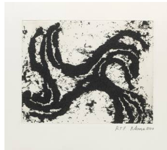
Junction #5 (RS10-3489)