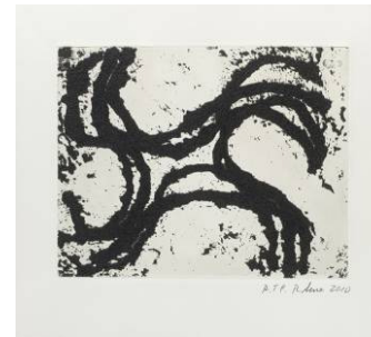
Junction #7 (RS10-3491)