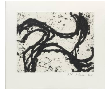
Junction #8 (RS10-3492)