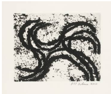
Junction #4 (RS10-3488)