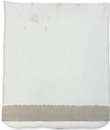
PRESSED PAINT (TITANIUM WHITE) 2017 Acrylic paint pressed in linen Approx. 34 x 27" (86.4 x 68.6 cm) A series of 26 unique works (projected), #8 AS17-253