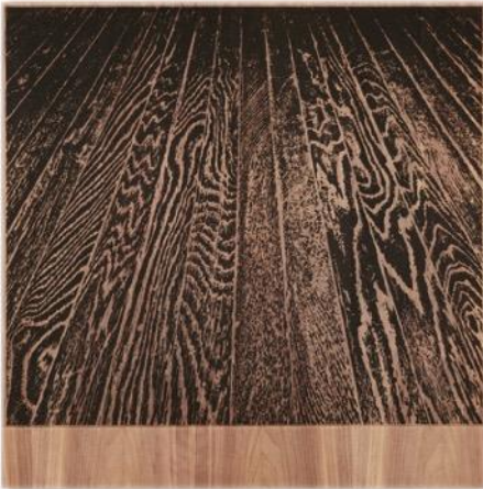
WOODEN FLOOR ON WOOD (ONE-POINT PERSPECTIVE) 2017 Photoetching on wood 26 3/4 x 26 3/4 x 3/4" (67.9 x 67.9 x 1.9 cm) Edition of 38 (projected) AS17-3560