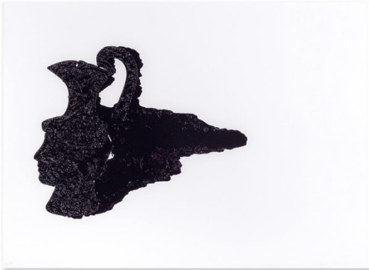
HEAD VASE (SPILLED INTERIOR) 2017 Stenciled ink monograph 22 x 30" (55.9 x 76.2 cm) A series of 34 unique works, #17 AS17-245