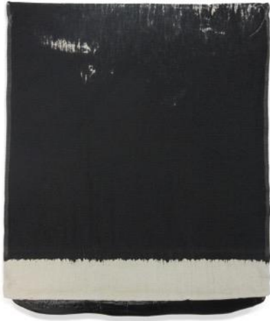
PRESSED PAINT (MARS BLACK) 2017 Acrylic paint pressed in linen Approx. 34 x 27" (86.4 x 68.6 cm) A series of 26 unique works (projected), #8 AS17-252