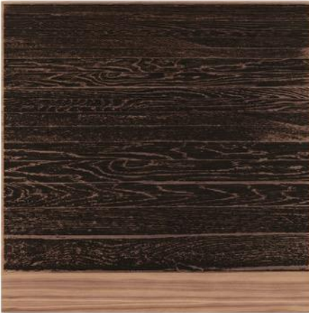
WOODEN FLOOR ON WOOD (HORIZONTAL) 2017 Photoetching on wood 26 3/4 x 26 3/4 x 3/4" (67.9 x 67.9 x 1.9 cm) Edition of 38 (projected) AS17-3559