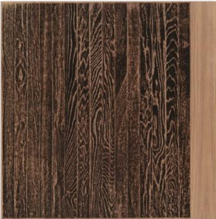
WOODEN FLOOR ON WOOD (VERTICAL) 2017 Photoetching on wood 26 3/4 x 26 3/4 x 3/4" (67.9 x 67.9 x 1.9 cm) Edition of 38 (projected) AS17-3561