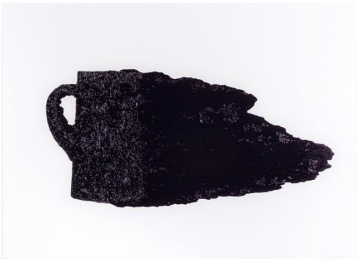
PITCHER #5 (SPILLED INTERIOR) 2017 Stenciled ink monoprint 22 x 30" (55.9 x 76.2 cm) A series of 34 unique works, #18 AS17-250