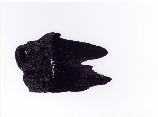
PITCHER #2 (SPILLED INTERIOR) 2017 Stenciled ink monograph 22 x 30" (55.9 x 76.2 cm) A series of 34 unique works, #9 AS17-247