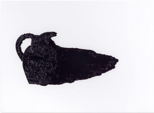
PITCHER #1 (SPILLED INTERIOR) 2017 Stenciled ink monograph 22 x 30" (55.9 x 76.2 cm) A series of 34 unique works, #15 AS17-246