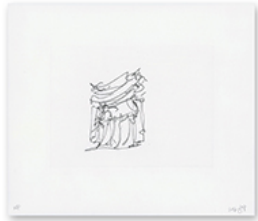
FRANK GEHRY VUITTON/KOREA 2016 1-color etching 15 1/2 x 18" (39.4 x 45.7 cm) Edition of 35, #16 FG16-3551