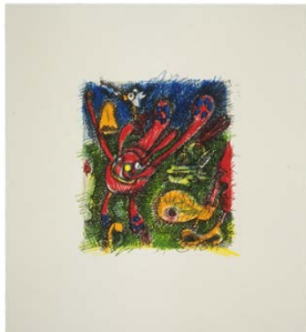
ELIZABETH MURRAY RED VIOLET 1995 8-color lithograph/silkscreen/intaglio sheet 16 3/4 x 15 3/8" (42.5 x 39.1 cm) Edition of 59, #49 EM94-1368