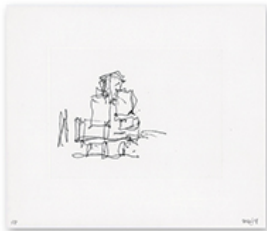
FRANK GEHRY HOUSE STUDY DETAIL C 2016 1-color etching 15 1/2 x 18" (39.4 x 45.7 cm) Edition of 35, #16 FG16-3550