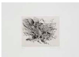
JULIE MEHRETU UNTITLED 1 (AMULETS) 2008 1-color etching/chine-colle 12 x 14" (30.5 x 35.6 cm) Edition of 150 JM08-3441