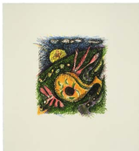
ELIZABETH MURRAY NIGHT AND DAY 1995 8-color lithograph/silkscreen/intaglio sheet 16 3/4 x 15 3/8" (42.5 x 39.1 cm) Edition of 66, #33 EM94-1370