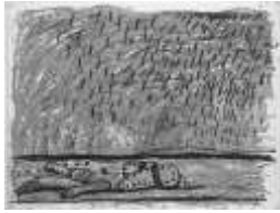
VIEW 1983 1-color lithograph Estate Stamped 30 x 42 1/2" Edition of 50 PG79-923