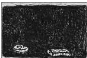
OBJECTS 1983 1-color lithograph Estate Stamped 20 x 30" Edition of 50 PG79-935