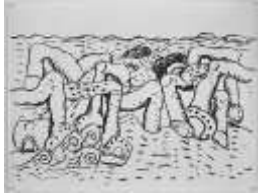
AGEAN 1981 1-color lithograph 32 x 42 1/2" Edition of 50 PG79-915