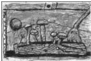
EASEL 1983 1-color lithograph Estate Stamped 20 x 30" Edition of 50 PG79-934