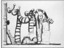
STUDIO CORNER 1980 1-color lithograph 32 x 42 1/2" Edition of 50 PG79-919