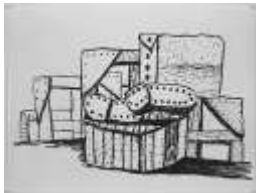
STUDIO FORMS 1980 1-color lithograph 32 x 42 1/2" Edition of 100 PG79-921