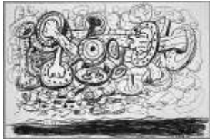
SKY 1983 1-color lithograph 20 x 29 3/4" Edition of 50 PG79-928