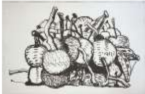
SUMMER 1981 1-color lithograph 20 x 30" Edition of 50 PG79-926