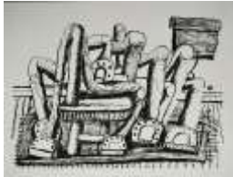
ROOM 1980 1-color lithograph 32 3/4 x 42 1/2" Edition of 50 PG79-916