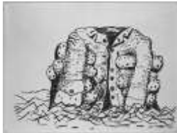
COAT 1979 1-color lithograph 32 x 42 1/2" Edition of 50 PG79-924