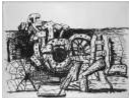
ELEMENTS 1980 1-color lithograph 32 3/4 x 42 1/2" Edition of 50 PG79-918