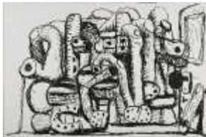
PILE UP 1983 1-color lithograph Estate Stamped 20 x 30" Edition of 50 PG79-933