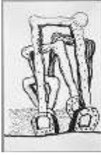
GROUP 1981 1-color lithograph 29 1/2 x 19 1/2" Edition of 50 PG79-912