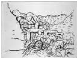
SEA GROUP 1983 1-color lithograph 32 x 42 1/2" Edition of 50 PG79-917