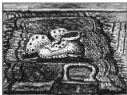
RUG 1980 1-color lithograph 19 1/2 x 29" Edition of 50 PG79-929