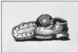
SHOES 1981 1-color lithograph Estate Stamped 20 x 30" Edition of 50 PG79-931