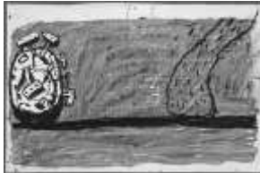
SCENE 1981 1-color lithograph 20 x 29 3/4" Edition of 50 PG79-930