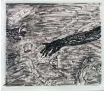
SLIP 2003 7-color lithograph 37 1/2 x 42" (95.3 x 106.7 cm) Edition of 56, #24 SR02-1494