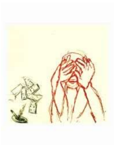
CRYING 2003 5-color lithograph/screenprint 34 x 35" (86.4 x 88.9 cm) Edition of 50, #21 SR02-1493