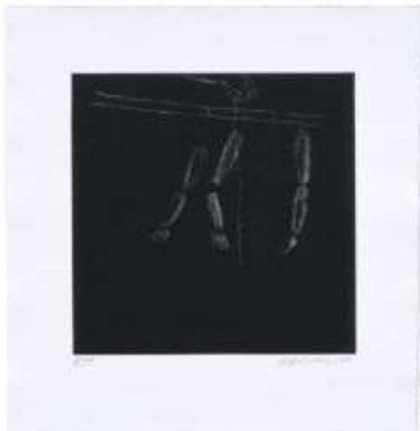
PUPPET SERIES #2 2008 1-color mezzotint 16 1/2 x 16" (41.9 x 40.6 cm) Edition of 50, #17 SR08-3435