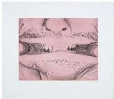
SOFT GROUND ETCHING – ROSE 2007 2-color etching 29 3/4 x 34" (75.6 x 86.4 cm) Edition of 50, #8 BN06-3412