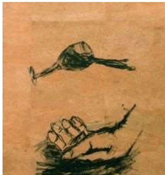
UNCORKED 2003 2-color lithograph/screenprint on cork 24 x 22" (61.0 x 55.9 cm) Edition of 58, #37 SR02-1496