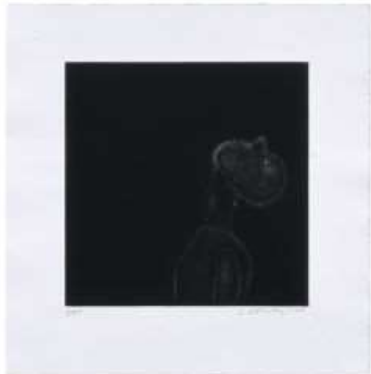
TILT UP 2008 1-color mezzotint 16 1/2 x 16" (41.9 x 40.6 cm) Edition of 50, #17 SR08-3448