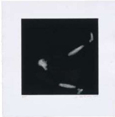
PUPPET SERIES #4 2008 1-color mezzotint 16 1/2 x 16 1/8" (41.9 x 41.0 cm) Edition of 50, #20 SR08-3446