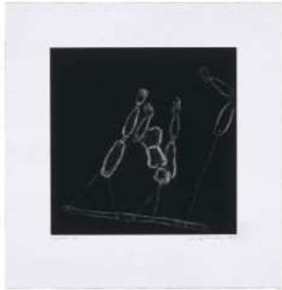
PUPPET SERIES #1 2008 1-color mezzotint 16 1/2 x 16" (41.9 x 40.6 cm) Edition of 50, #17 SR08-3434