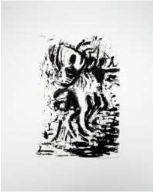
SPINNING (STATE) 2006 1-color lithograph 22 x 17 1/2" (55.9 x 44.5 cm) Edition of 24, #12 SR86-1127A