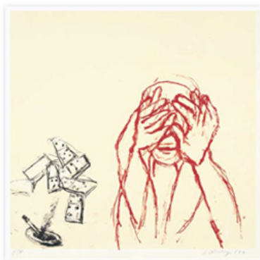
Susan Rothenberg Crying, 2003 (SR02-1493)