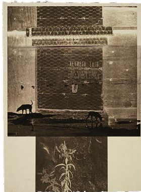
LILLY SCENT 1981 4-color lithograph 32 x 24" Edition of 50, #46 RR81-1036