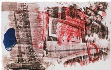
SUB-TOTAL 1972 3-color lithograph 8 x 12 1/2" Edition of 500, #324 RR69-304