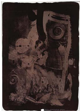
EARTH CRUST 1969 2-color lithograph 34 x 25" Edition of 42, #15 RR69-287