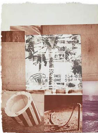
ROOKERY MOUNDS - GRAY GARDEN 1979 4-color lithograph 41 x 31" Edition of 55, #27 RR79-896