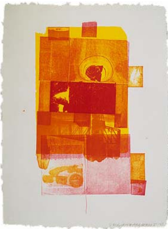
ROMANCES (POMEGRANATE) 1977 4-color lithograph 41 3/4 x 31 1/2" Edition of 37, #1 RR77-835