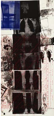
BOOSTER 1967 5-color lithograph/screenprint 72 x 35 1/2" Edition of 38 RR67-106