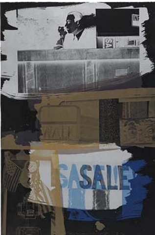
FENCE 1991 4-color lithograph 44 1/2 x 30" Edition of 57, #23 RR91-1283