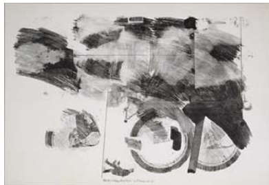
TEST STONE #7 1967 1-color lithograph 33 x 48" Edition of 38, #18 RR67-108